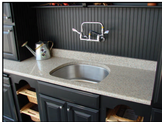
U-2321 shown undermounted in quartz.