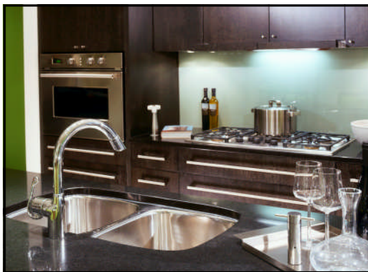
U-5050 shown undermounted in granite.